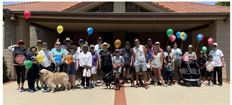
Our 2023 CROP Walk participants! 22 Adults, 4 Youth, 4 Kids, & 3 Dogs